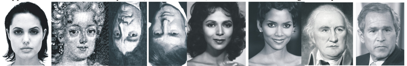
Angelina Jolie Duchesse De Bourgogne Comte de Ponchartrain Donald Trump Dorothy Dandridge Halle Berry Daniel Morgan George W. Bush