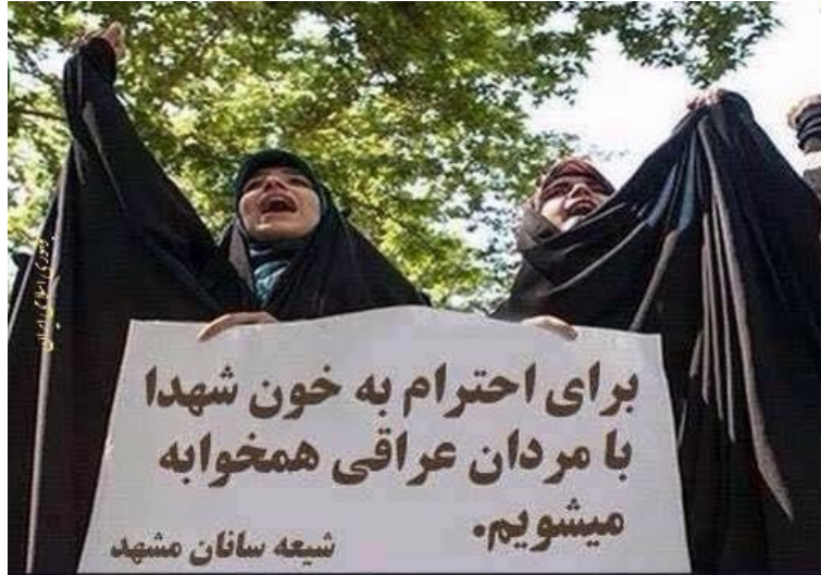
Out of respect for blood of martyred, we proudly sleep with Arab Iraqi men 1 .

In a chaotic situation, Syrian and Palestinian so-called security forces target young Iranian women, and kidnap, beat, torture them in front of hundreds of fearful bystanders in bright daylight, and take them to unknown whereabouts.