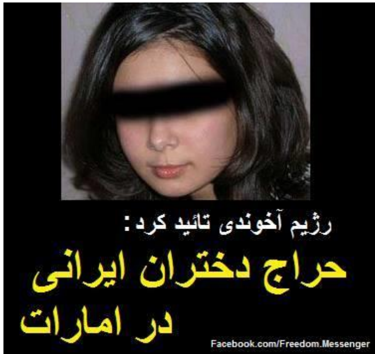
The Arab mullah's regime has confirmed the auctions of Persian teen-agers in Arab Emirates