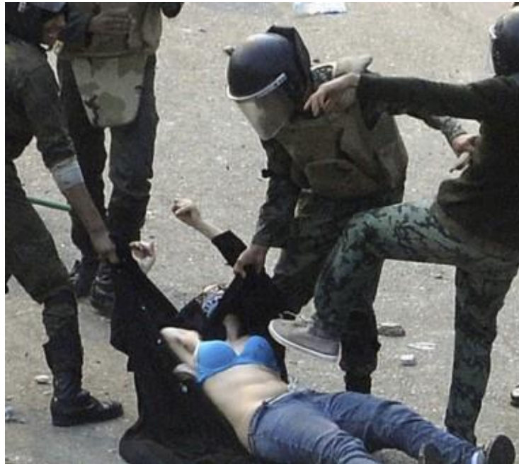
Syrian, Palestinian so-called security force target young Iranian women, kidnapped, in front of hundreds of fearful bystanders in bright daylight, taken to an unknown whereabouts.